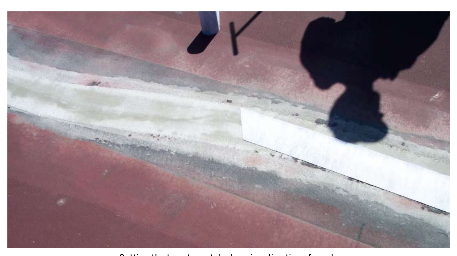
Cutting the tape to match changing direction of crack.