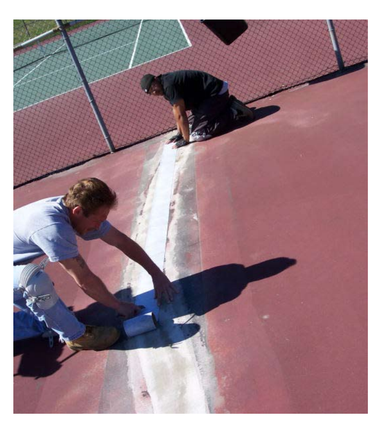
Applying RiteWay MicroSealant tape to the crack.