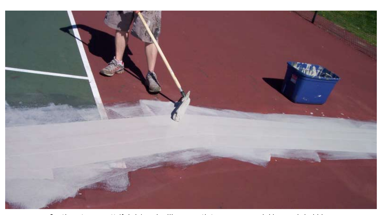
Coating stress matt (fabric) and rolling smooth to ensure no wrinkles or air bubbles.