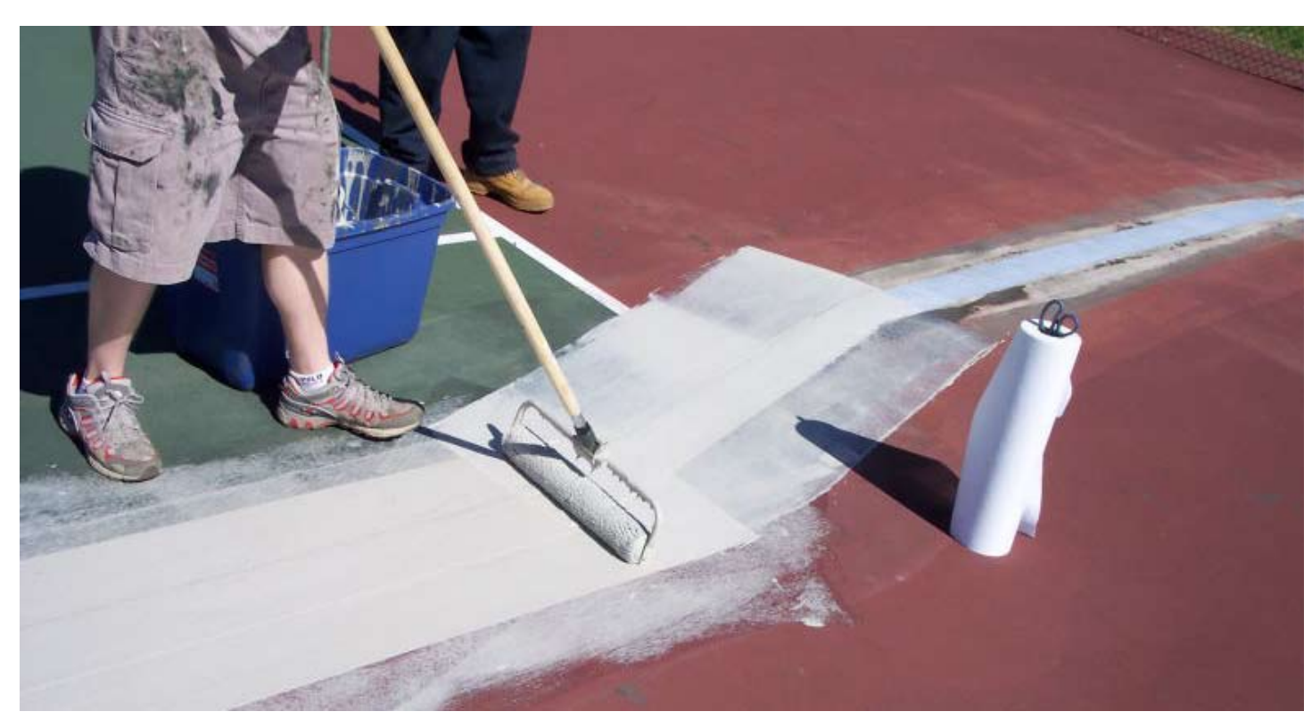
Applying acrylic to first layer of tape, then applying stress matt (fabric).