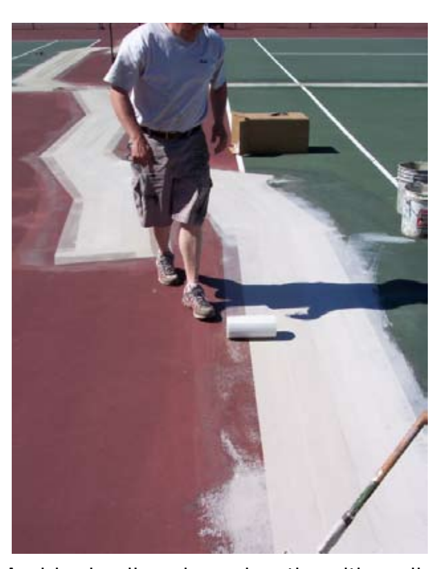
Applying bonding edge and coating with acrylic.