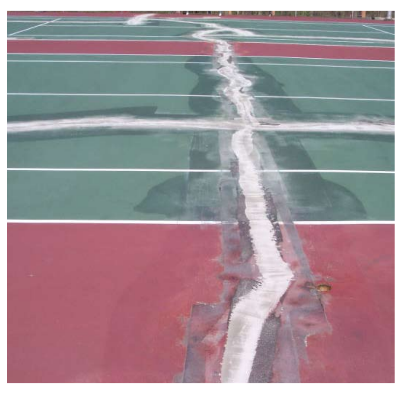
Properly filled crack. Routed and filled from bottom up, then buffed smooth.