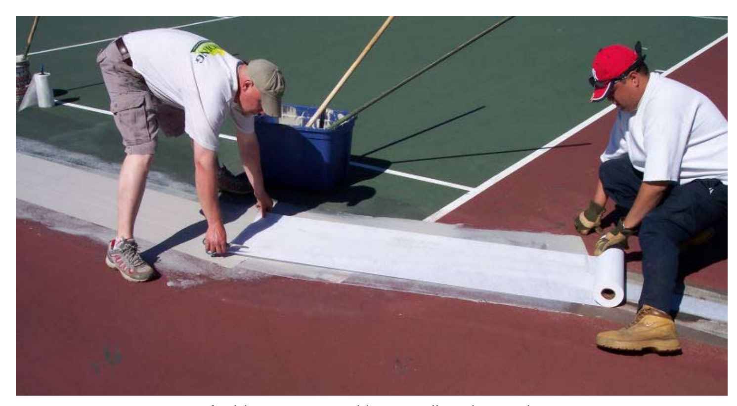
Applying stress matt with wet acrylic and no sand.