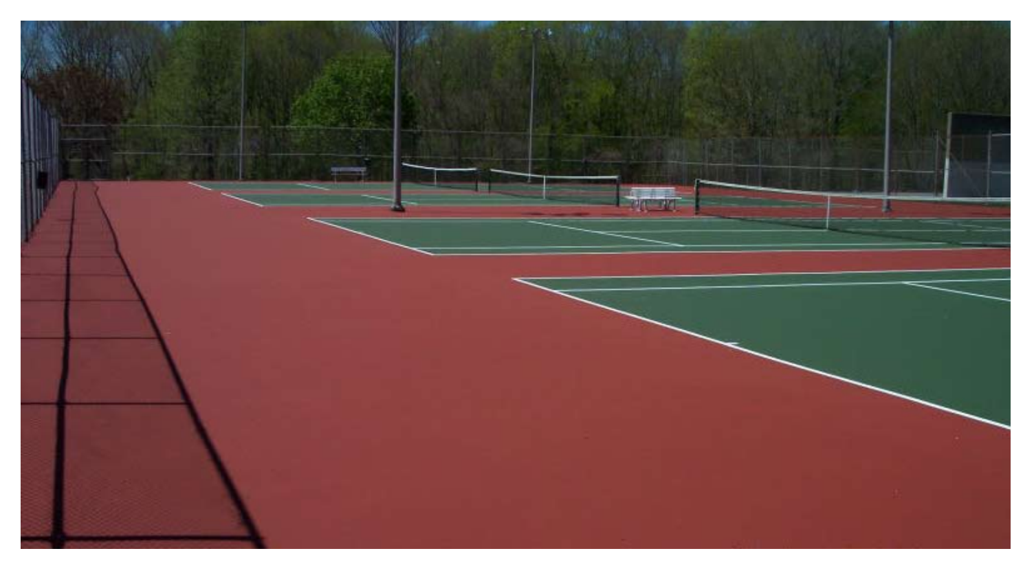
No bubbles. No dead spots. No hollow-sounding areas. A true ball bounce!