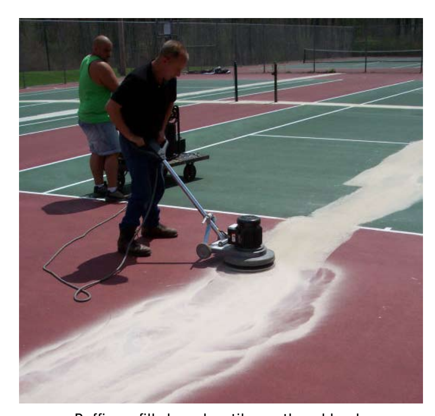
Buffing a filled crack until smooth and level.