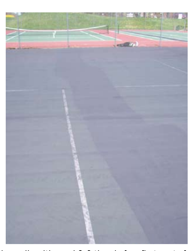
Repairs are coated with acrylic with sand 2-3 time before first coat of resurfacer to entire court. This hides the repair.