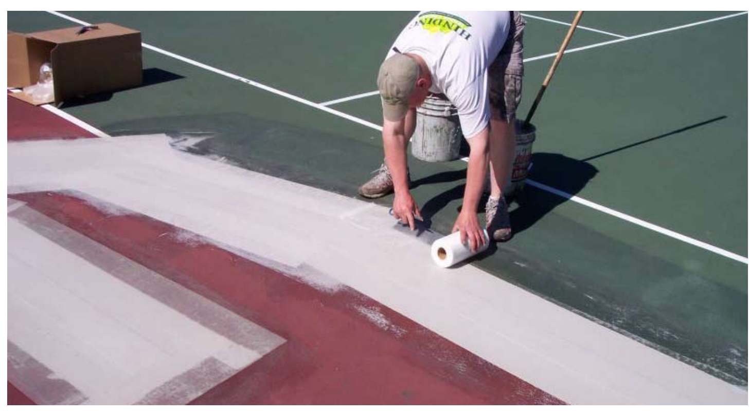
Cutting bonding where crack changes direction, then coating bonding edge with acrylic, no sand.